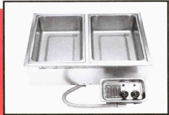
Top Mount w/EZ-Lock

Element is mounted under well and secured by aluminized deflector shield for maximum efficiency. Unit standard with APW Wyott E-Z Locks on all four exterior sides for easy installation. The units feature complete UL construction including electrical conduit, bezel and control box.