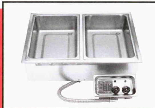
Top Mount w/EZ-Lock