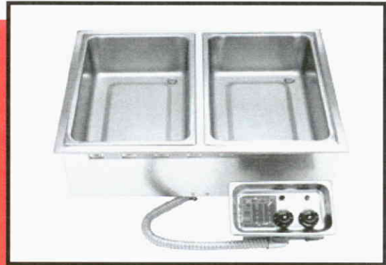
Top Mount w/EZ-Lock

Element is mounted under well and secured by aluminized deflector shield for maximum efficiency. Unit standard with APW Wyott E-Z Locks on all four exterior sides for easy installation. The units feature complete UL construction including electrical conduit, bezel and control box.