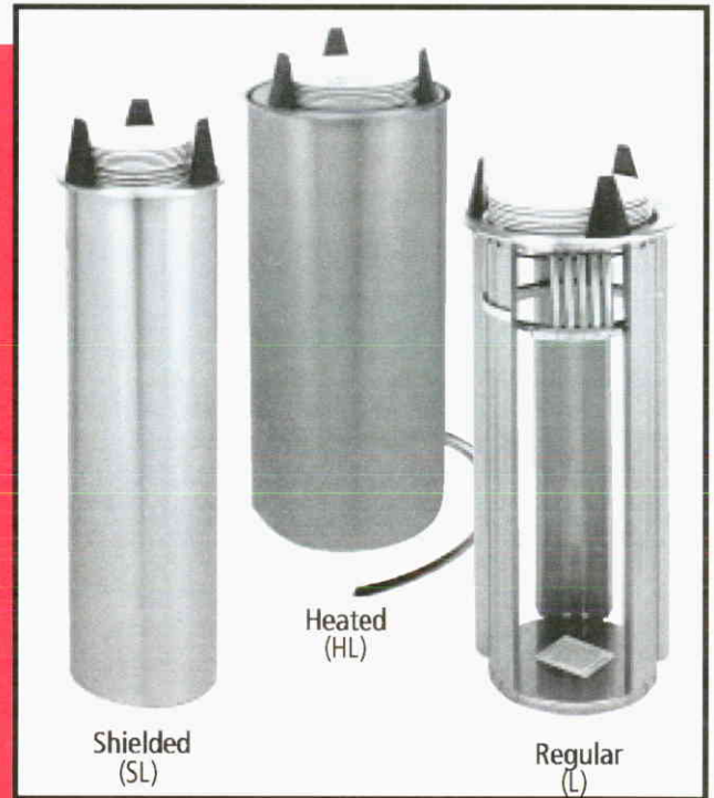
Lowerator® Drop-In Dish Dispensers