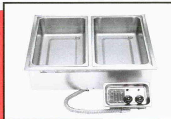
Top Mount w/EZ-Lock

Element is mounted under well and secured by aluminized deflector shield for maximum efficiency. Unit standard with APW Wyott E-Z Locks on all four exterior sides for easy installation. The units feature complete UL construction including electrical conduit, bezel and control box.